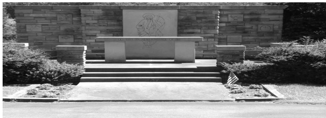
Holy Family Polish National Catholic Cemetery